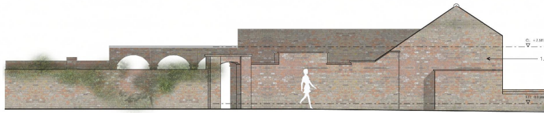
Existing West Elevation Scale 1:100@A3